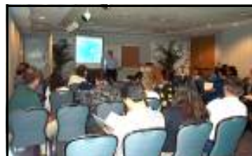
PCS presentation at Ala Moana

PCS is being used successfully in the Los Angeles Archdiocese and 20 in the San Diego Archdiocese.