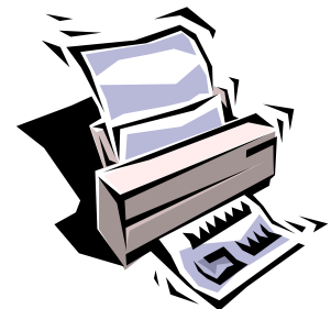
COMPUTER SUPPORT !